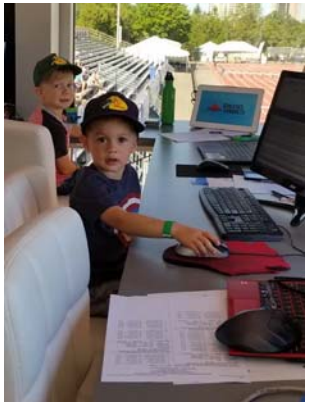
Future officials !!!