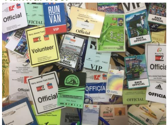
Kanwal's collection of Officiating Name Tags