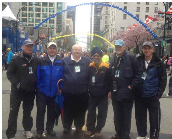
Start Line Officials at the 2015 Sun Run

As an Official - ensure that each athlete is given every possible opportunity to achieve their best performance in a safe, impartial, and fair competition in accordance with competition rules. Enjoy!