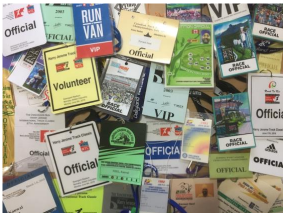
Kanwal's collection of Officiating Name Tags